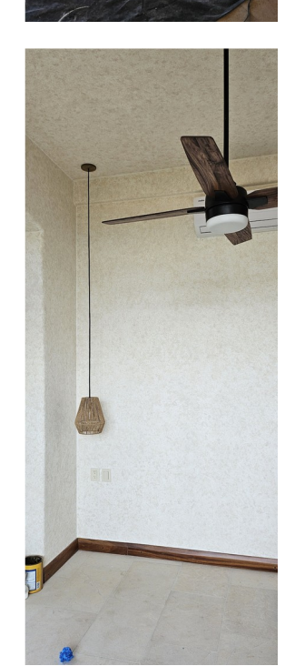
Acacia tower (inside villas)